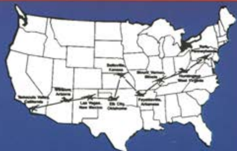
1990 RACE ROUTE