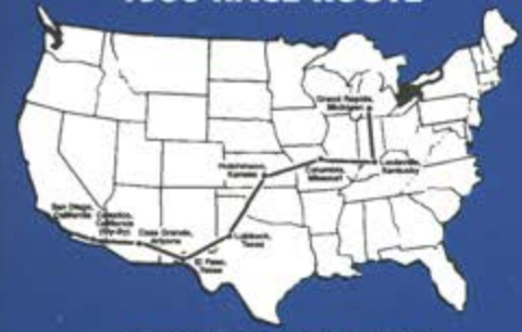
1983 RACE ROUTE