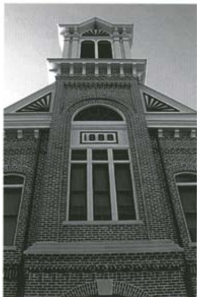
Courthouse in nearby Powhatan Historic State Park

We invite you to experience and celebrate Arkansas's place in the fabric of America. Arkansas's widely varied landscapes are home to a rich history. A trip across the state can lead from Mississippi River bottoms to mid-America's most prominent peaks; from a legacy of Deep South cotton culture to a town on a Wild West frontier. Among the stories told along the way are tales of Native Americans, pioneers who built the state, Civil War battles, an oil boom, blues and mountain folk music, diamonds, nine students who helped forge the spirit of the civil rights movement, and a native son who rose to the U.S. Presidency.