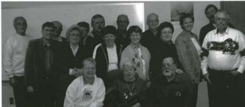
Flying Conestogas Aviation Booster Club

So whether you're taking a step back in time to visit our deep historic roots or racing to the future at the Beatrice Speedway, you'll find yourself captivated by the beauty of Beatrice. Beatrice welcomes you with friendly shopping, five-star dining, and attractions galore.