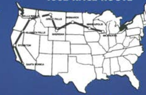
1979 RACE ROUTE