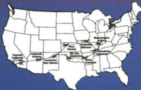
1992 RACE ROUTE