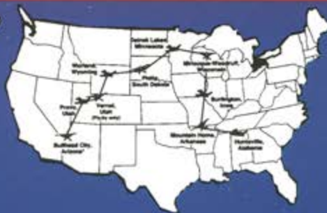
1991 RACE ROUTE