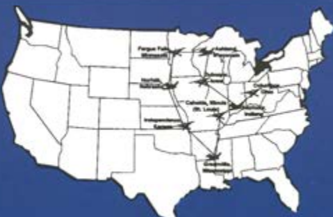
1994 RACE ROUTE