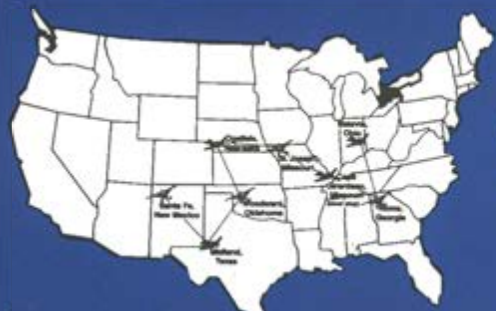
1998 RACE ROUTE