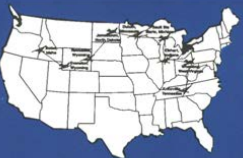
1997 RACE ROUTE