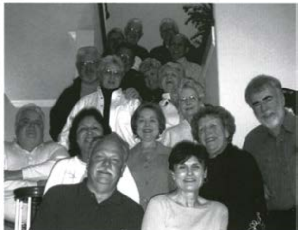
ARC Planning Committee

From its frontier trade and petroleum beginnings to its present diversity of manufacturing, research, and ranching, the Bartlesville area presents a unique blend of cosmopolitan attitude mixed with neighborhood friendliness.