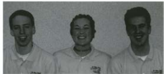
The Airport Operations Tri-fecta