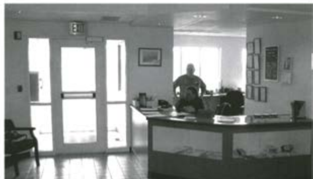
Frankfort Flight Service, Inc. is the full-service FBO on the field, offering aircraft rental, instruction, charter flights, and the cheapest fuel around.