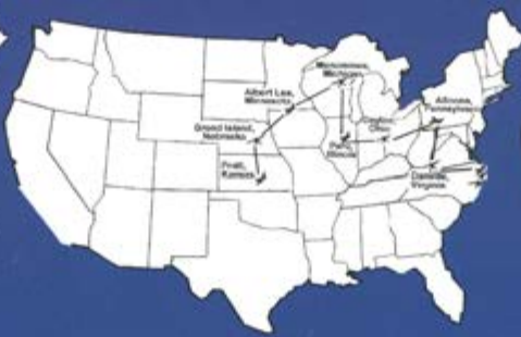
2003 RACE ROUTE