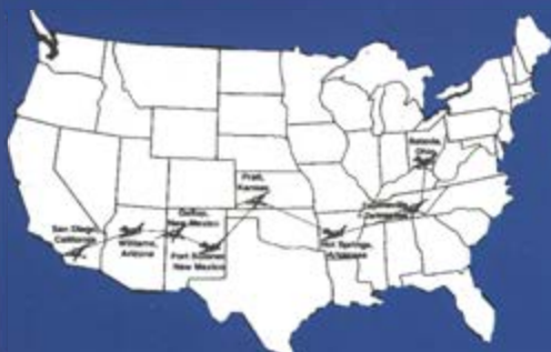
2001 RACE ROUTE