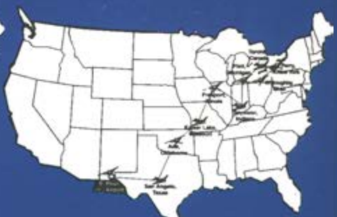
1999 RACE ROUTE