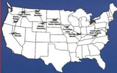
1995 RACE ROUTE