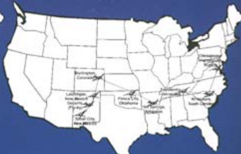
2002 RACE ROUTE