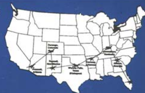
1996 RACE ROUTE