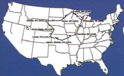
2004 RACE ROUTE