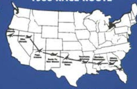
1985 RACE ROUTE