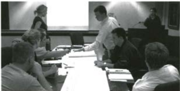
Committee Head Planning Meeting