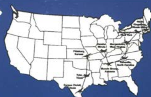
1993 RACE ROUTE