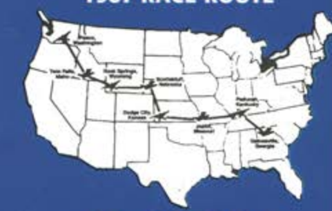
1984 RACE ROUTE