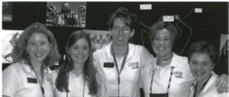
WAI Conference, March 2005