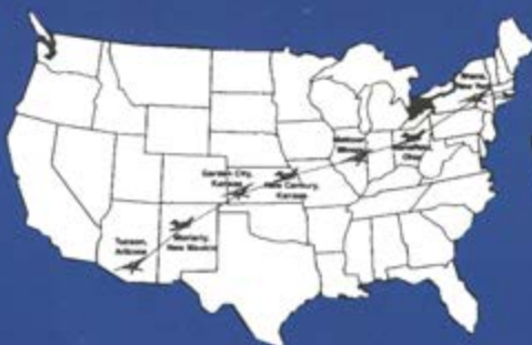
2000 RACE ROUTE